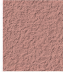
SANGRIA 1.5 LBS 1117