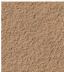
HARVEST GOLD 2 LBS 5084