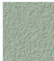
WILLOW GREEN 3 LBS 5376