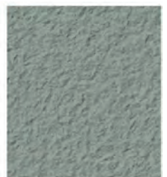
GREEN SLATE 3 LBS 3685

Note: Color Selections in this brochure are approximations only and represent as closely as possible, in a printed version, the appearance of Renew-Crete products when cured and sealed using Renew-Crete High Gloss Sealer. Variations can be expected due to finishing techniques, lighting and jobsite conditions. If exact color is a concern, you should request an actual sample.