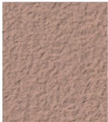
YOSEMITE BROWN 2 LBS 641