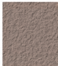
COCOA 2 LBS 6130