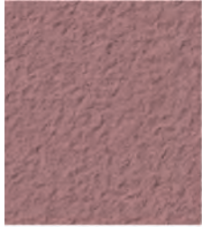
RUSTIC BROWN 2 LBS 6058

Specify Renew-Crete: Choose a color from this color selector and specify it by name and color number. Add color call-out to plan documents or specifications. For complete architectural and guide spec information visit our web site, call, fax, or email us at overlays@RenewCrete.com .