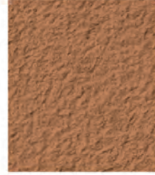
TERRA COTTA 4 LBS 10134