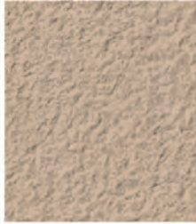
SAN DIEGO BUFF 1.5 LBS 5237