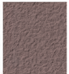
KAILUA 4 LBS 677