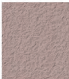
MOCHA 1 LB 6058