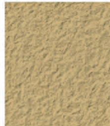
MESA BUFF 2 LBS 5447