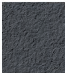
DARK GRAY 1 LB 8084