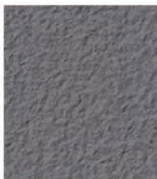
COBBLESTONE 2 LBS 860