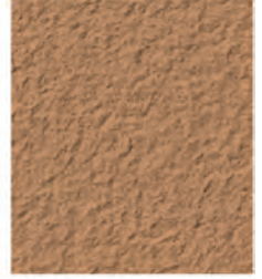
SPANISH GOLD 3 LBS 5084