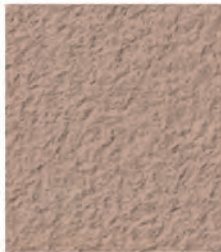
SOUTHERN BLUSH 1 LB 10134