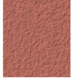
BRICK RED 4 LBS 160