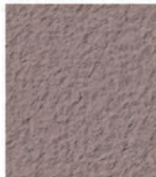
TAUPE 2 LBS 677