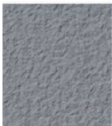
PEWTER 1 LB 860